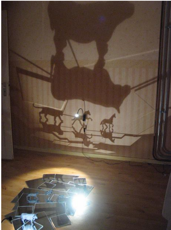
Dimitris Rentoumis, installation